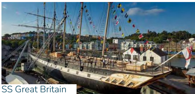
SS Great Britain

Trips to Bristol, Bath and London are organised throughout the year. Other trips may include meals out, theme parks, theatre trips, places of historical interest, sporting events and more! These trips are optional, but a great way to explore the UK and get an authentic British experience.